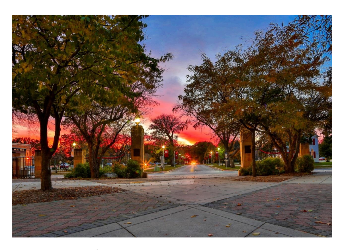
A member of the Minnesota State Colleges and University System and an Affirmative Action/Equal Opportunity University