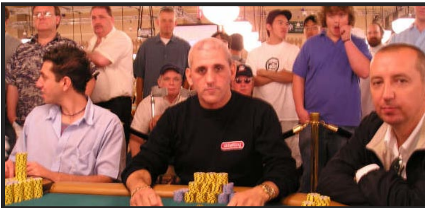
Students gather in the ROC to begin the fall tournament.

If you are interested in playing in the league this fall, make sure to keep an eye out for posters around campus and check in with the ROC at the beginning of the semester.